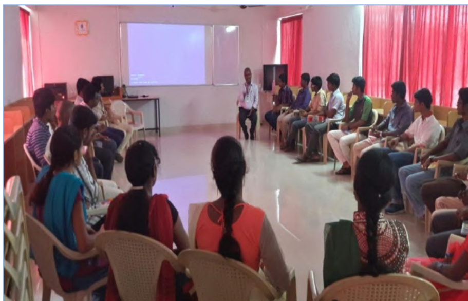
(“The Stories of Successful Young Entrepreneurs” for our students at RPTC)