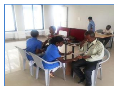
(Eye Screening Camp)