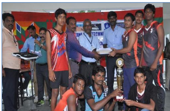
(Winner in Inter-School Tournament)