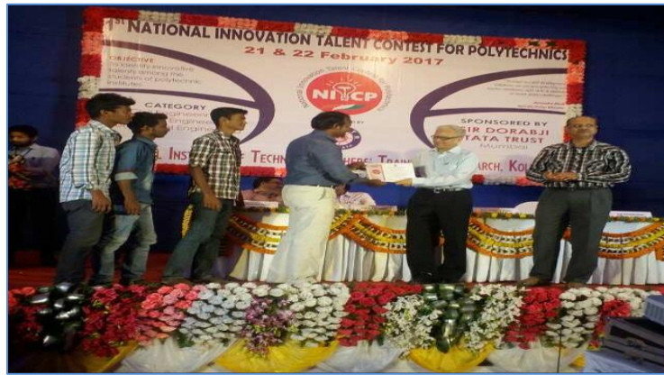
(National Level “Project – Paddy Harvesting Machine” competition at Kolkata)