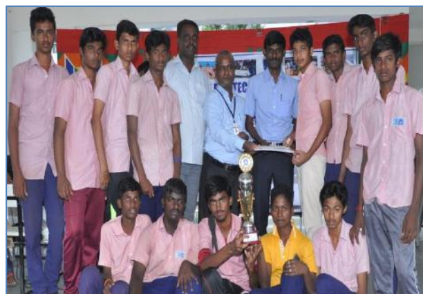
(Runner in Inter-School Tournament)