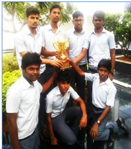
(Chess & Carrom Team, II Prize)