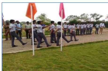
(68 th Republic Day)