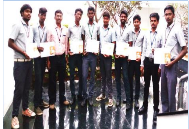
(Winners in State Level Mime Competition)