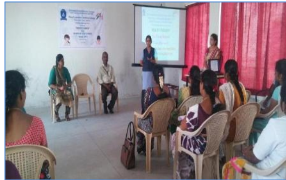
(Beauty Therapy Course at RPTC)