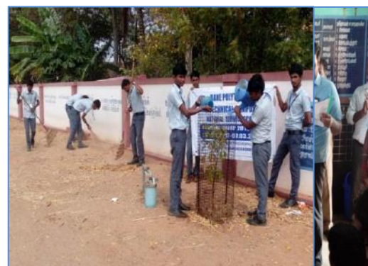
(NSS Special Camp)