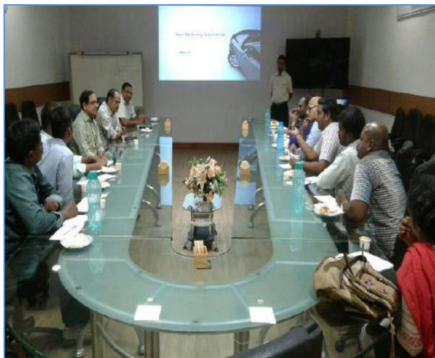
(Our staff's interaction at RML, Chennai)