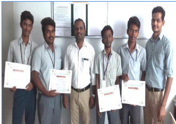
(Winners in State Level Paper Presentation)