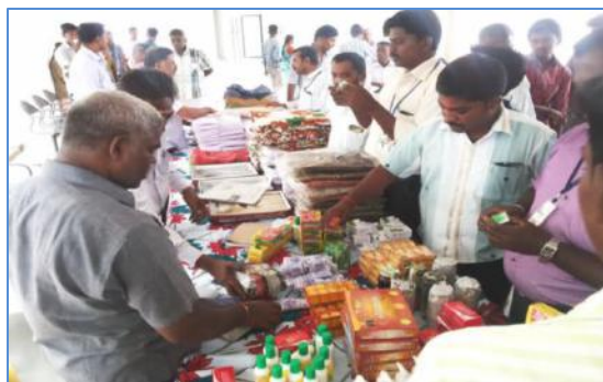
(Khadi Kraft Exhibition)