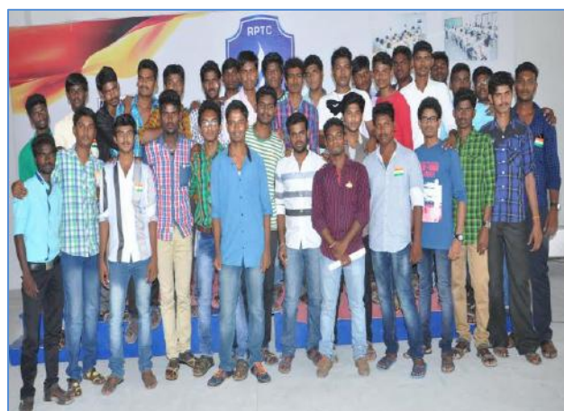
(Alumni – Group Photo)