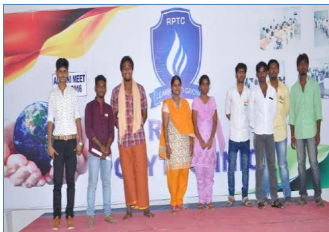
(Alumni Cell Office Bearers)