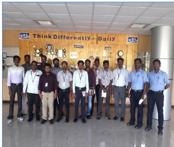
(Our staff members at RBL, Trichy)