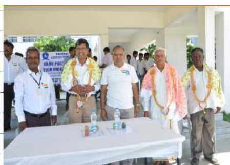
(70 th Independence Day)