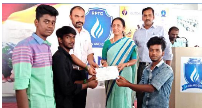
Runner in Carrom – IPAA Tournament, 2018