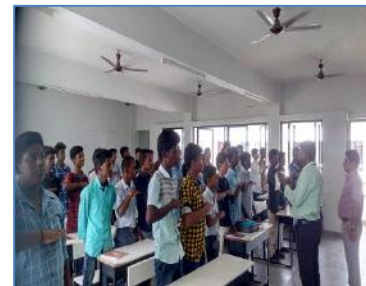
Drug Abuse - Awareness