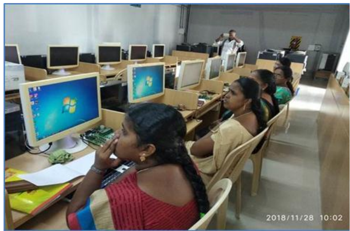
Training on PIC, PLC & Embedded System