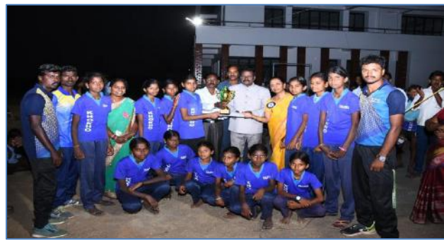
Winner in Kho-Kho