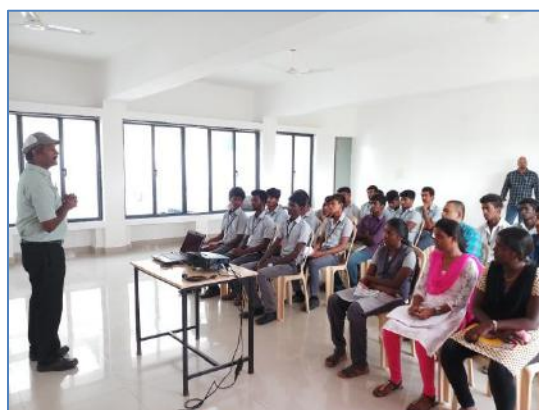
Training on “Preparation for Interview and Expectations of Industries”