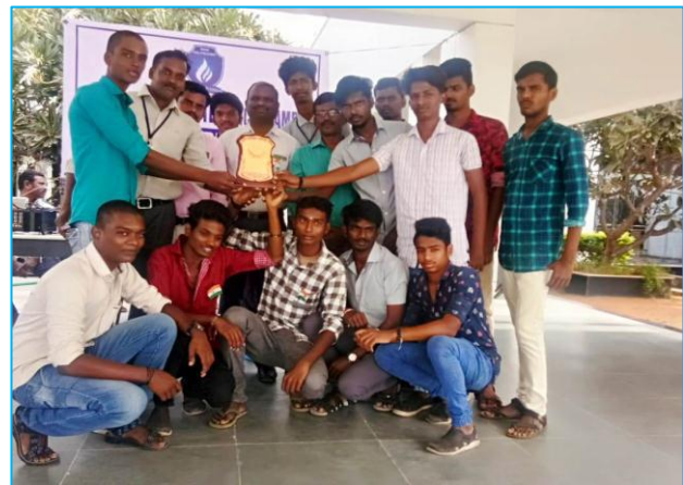
Winners were awarded prizes