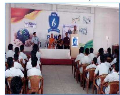
Youth Awakening Day