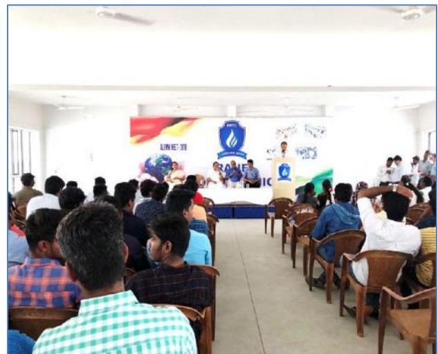
Participants of the Alumni Meet