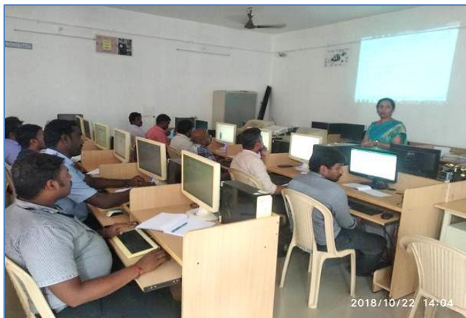
Training on Microsoft Excel