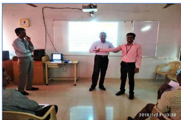
Second Level Counseling Workshop