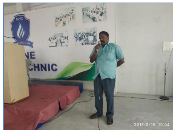
Parent Teacher Meet