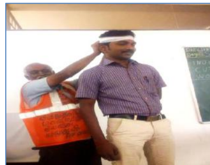
First Aid Safety