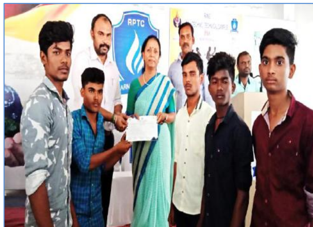
Runner in Chess IPAA Tournament, 2018