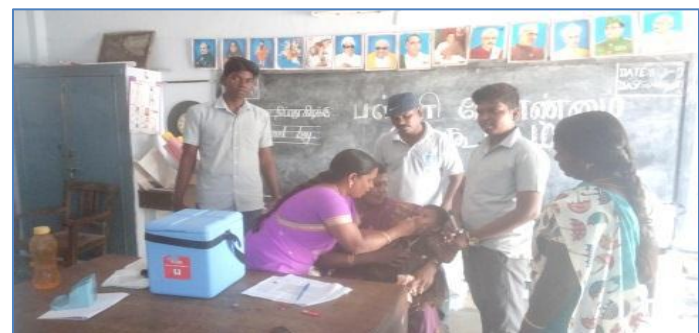
Pulse Polio Camp