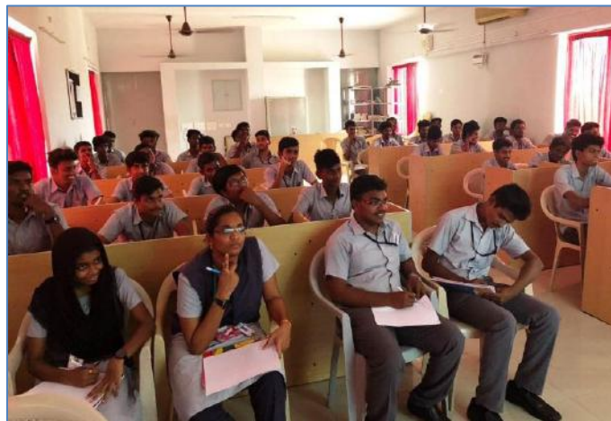
Intra-Departmental Activities in Mechanical Department