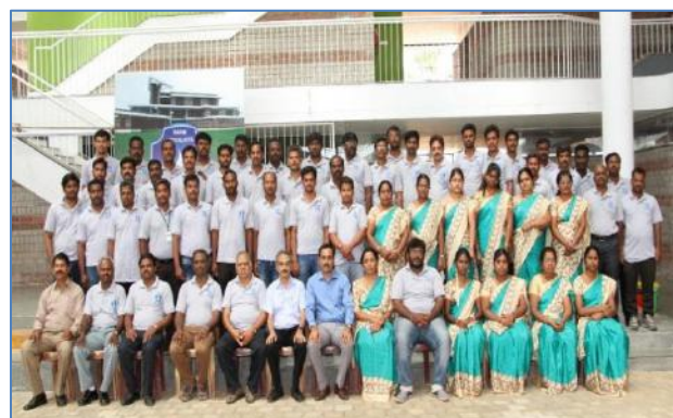
3 D Workshop – Dream, Design, Deliver