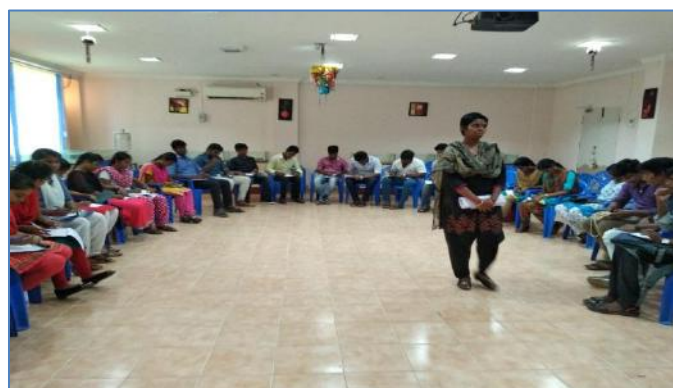
Entrepreneurship Cell Training Program