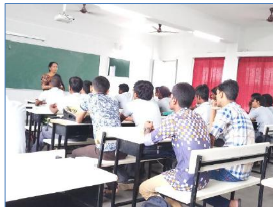
“Interview Skills Training”