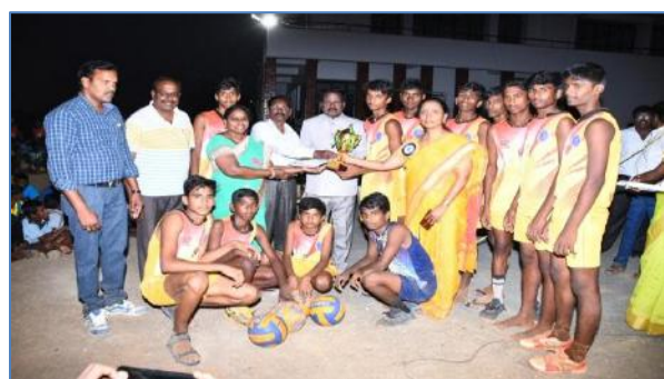
Winner in Volley Ball