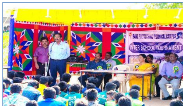
Chief Guest Speech