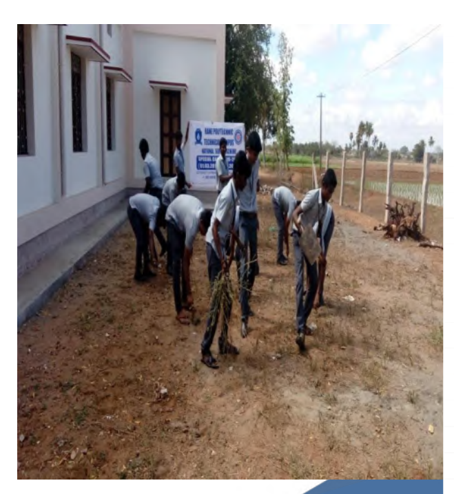
(Cleaning the Village)