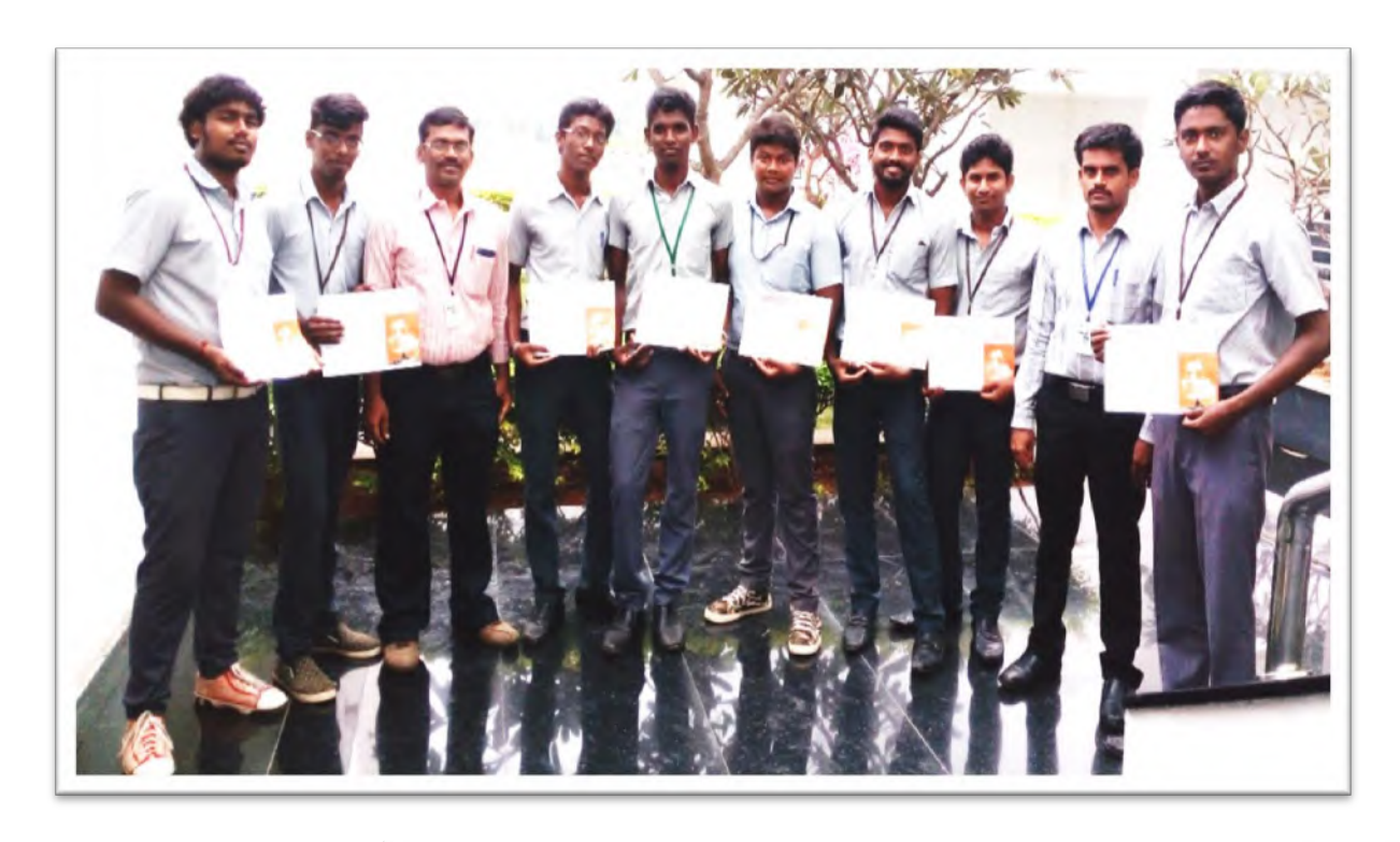
(Second Prize in MIME - State Level National Youth Day Competitions held in Vivekanantha Kendra, Kanniyakumari)