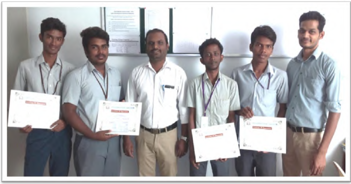
(Second Prize in Paper Presentation – State Level Technical Symposium held in Thangapazham Polytechnic College, Tirunelveli)