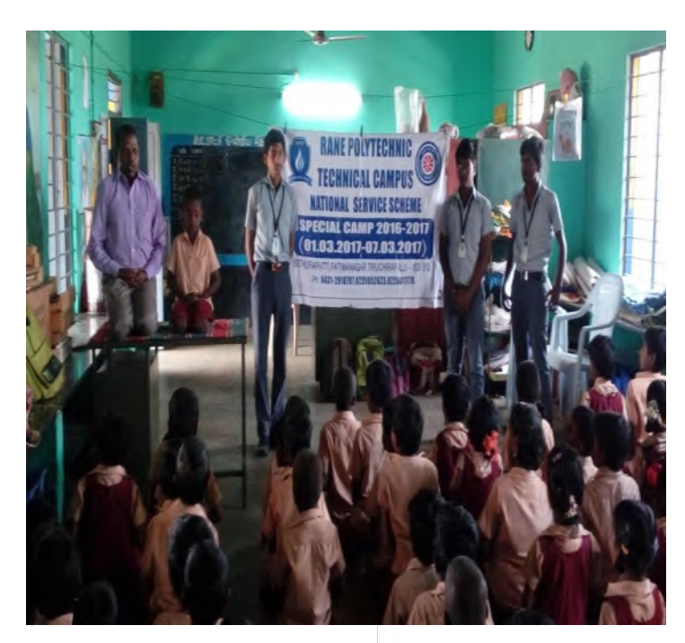
(YOGA for School Children)