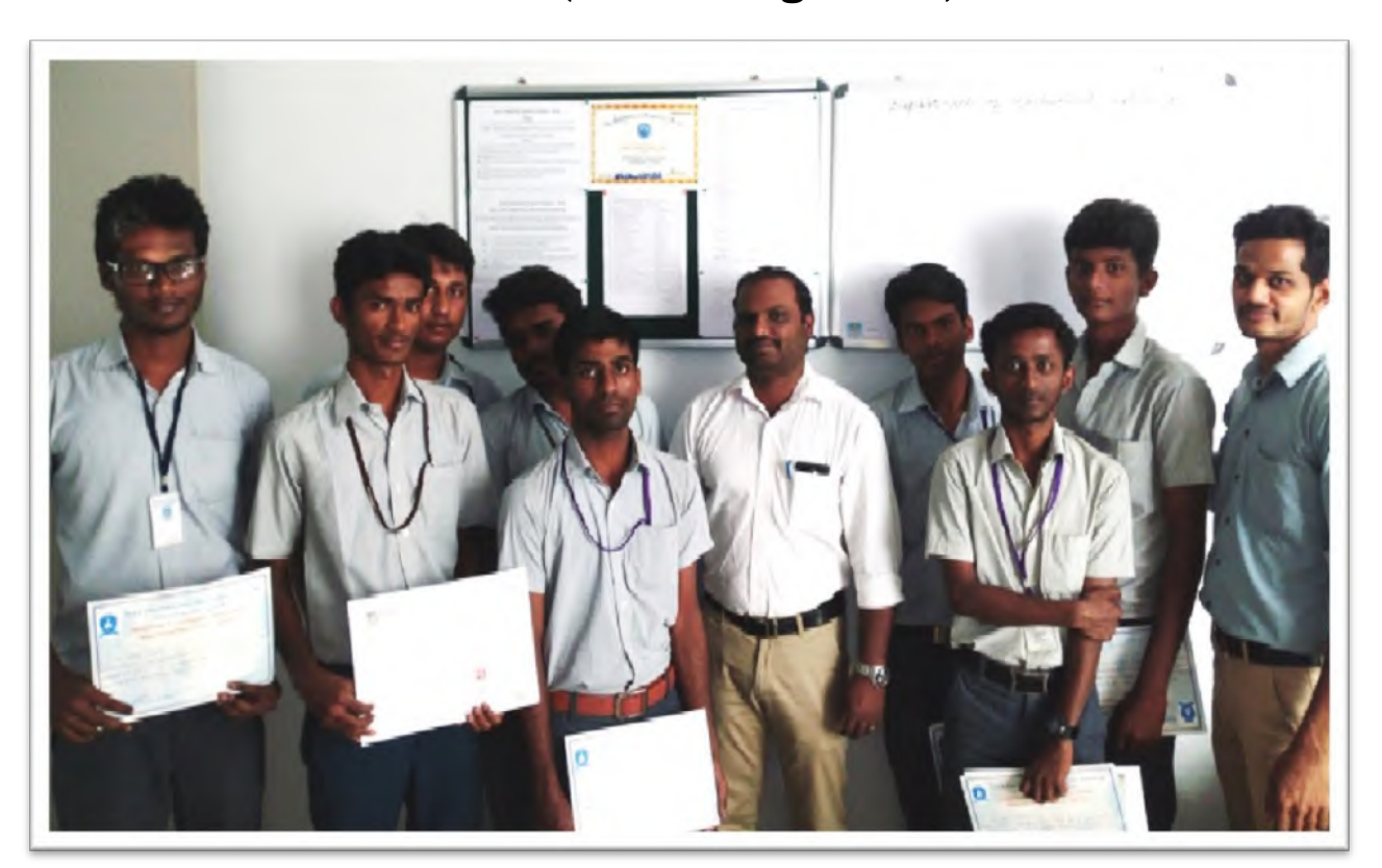
(Winners in Paper Presentation, Quiz and Connecting Points)